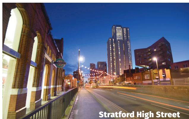
Stratford High Street

Duncan House is an impressive development in the heart of Stratford which is on track to complete this summer. It's a mix-use scheme anchored by just over 500 rooms of student accommodation principally housed in the tower element rising up to 32 storeys. At the top is a sky lounge which commands a panoramic view of London. There is also residential, academic and commercial space along with a basement level car park for the residents and employees.